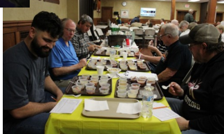
The judges hard at work