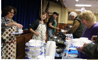
"The Crew" working hard to serve the fantastic samples